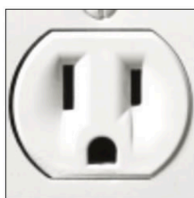
TYPE B NORTH AMERICAN NEMA 5-15 WALL OUTLET

The voltage aboard the yacht is 110v and the plug sockets around the boat will accept American plugs. See below for an example of the outlet onboard.