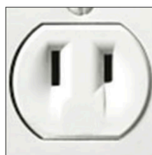
TYPE A NORTH AMERICAN NEMA 1-15 WALL OUTLET

For those from the USA, you don't need a power plug adapter in Mexico. Your power plugs fit. We recommend you to pack a 3 to 2 prong adapter in case type B sockets are not available. Your appliances with plug A and plug B fit.